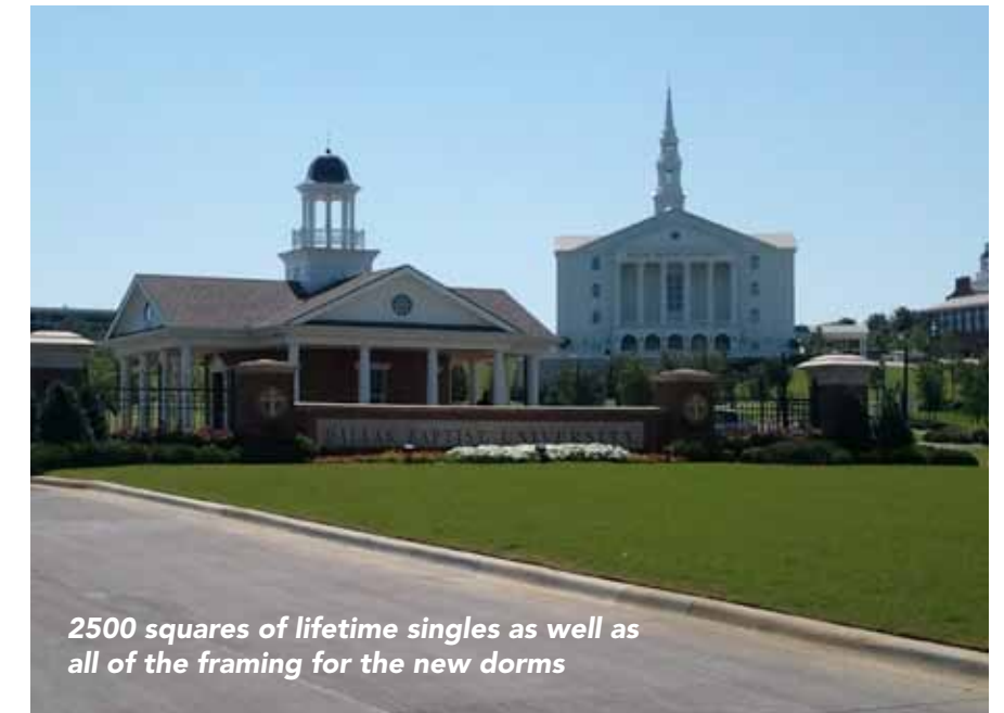
2500 squares of lifetime singles as well as all of the framing for the new dorms

You can feel confident that RRSA's leadership and teams will properly plan and execute your construction needs professionally and exceptionally so you do not have to focus on the details. We welcome an opportunity to demonstrate our approach and experience restoring all types of roofs and siding, and meeting our commercial customers' needs.