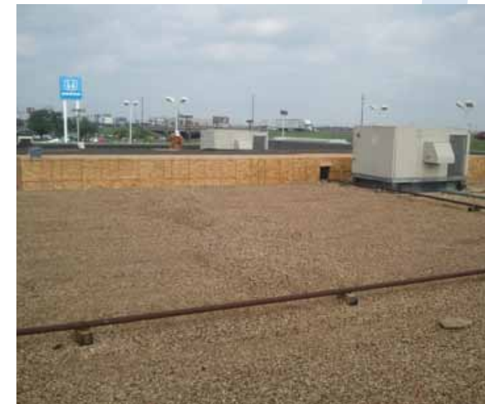
New car dealership in Dallas, Texas. 100 squares of TPO.